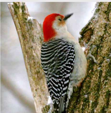
◀ Northern Cardinal, left Red-bellied Woodpecker, right