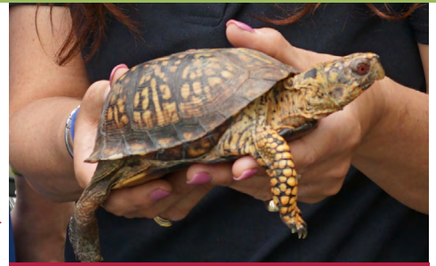
Woodland Box Turtle ▶