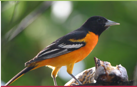
◀ Baltimore Oriole